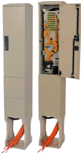
Fiber Optic Hybrid Pillar SUS-PH

Optic Pillars designed for FTTH applications and hybrid solutions.